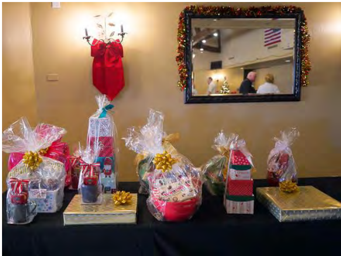
Just a few of the over twenty door prizes we gave away at the party