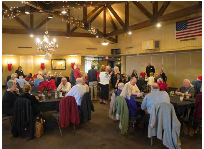
A view from the back of the room of just some of the guest in attendance during the social hour