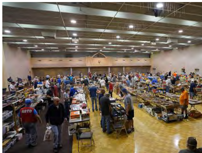
Here's one from the stage at the front of the Hall.